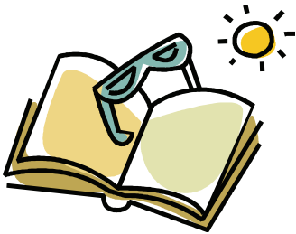
Summer Library Programs

The Friends of the Lincoln Library will be holding their annual BOOK and BAKE Sale on Sat July 12th from 9-2 under the tent next to the library. There will be books, videos and some of the best baked good this side of anywhere! If you would like to bake something, please call 745-8159. The Blake Mountain Band will be entertaining us from 12-2pm over at the Gazebo on Main Street in Lincoln.