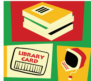
See how each of these are important at the library